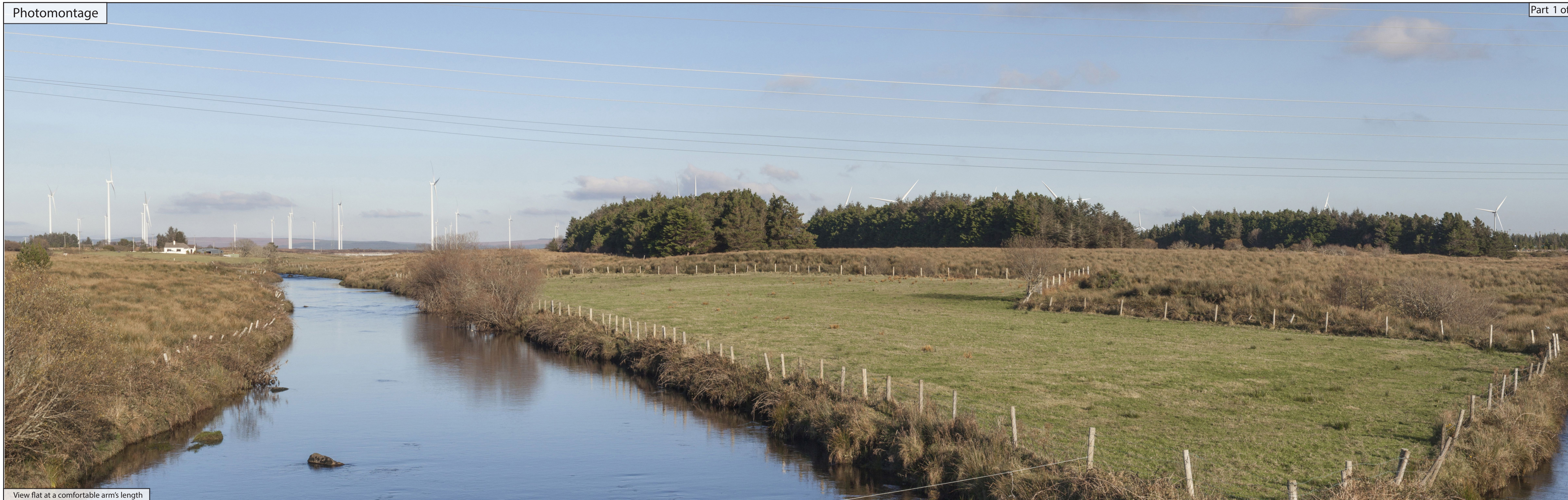
View flat at a comfortable arm's length

This planar projection panorama has been captured, prepared and presented in accordance with the guidance set out in the Scottish Natural Heritage 2017 guidance 'Visual Representation of Wind Farms'.